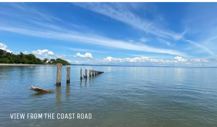
VIEW FROM THE COAST ROAD

DISTANCE: 19.5 MILE DIFFICULTY: MEDIUM TRAFFIC: MODERATE